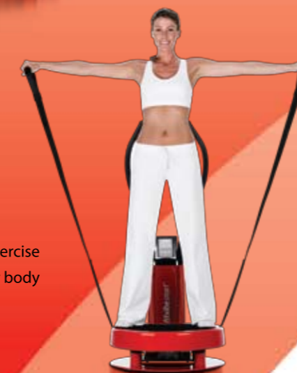
Example exercise for the upper body