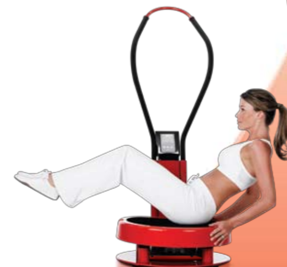
Example exercise for the abdominal muscles