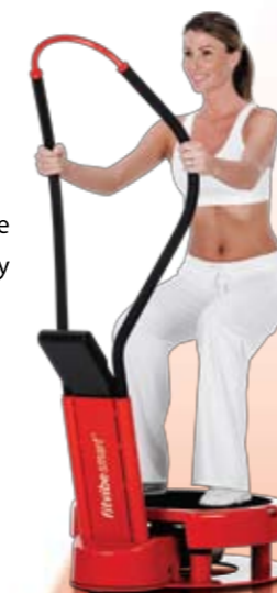
Example exercise for the lower body