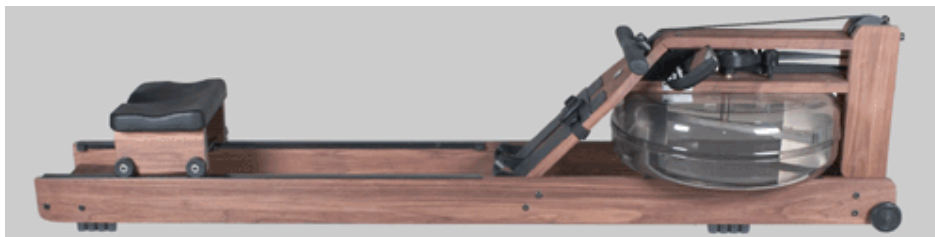
WaterRower Classic kr. 11.500,- ex VAT