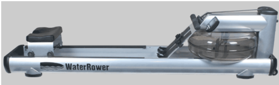
WaterRower M1 low rise kr. 11.750,- ex VAT