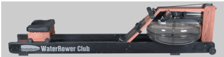
WaterRower Club kr. 9.200,- ex VAT