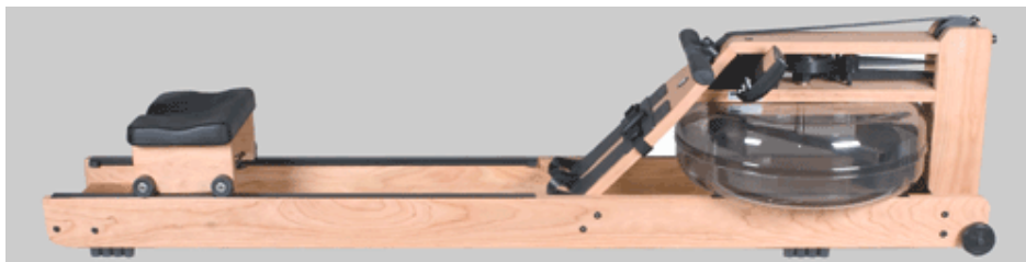
WaterRower Oxbridge kr. 10.750,- ex VAT