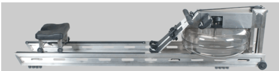
WaterRower S1 kr. 12.500,- ex VAT